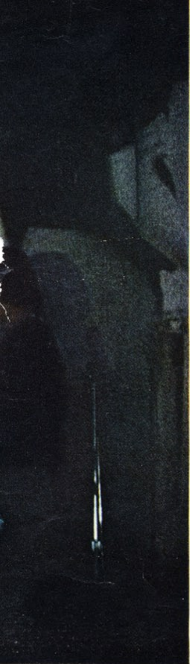
Andy Warhol's touring troupe, The Exploding Plastic Inevitable, creates a cacophony for dancers at The Trip in Los Angeles, while films of troupe, made by Warhol, are shown on screens at rear.