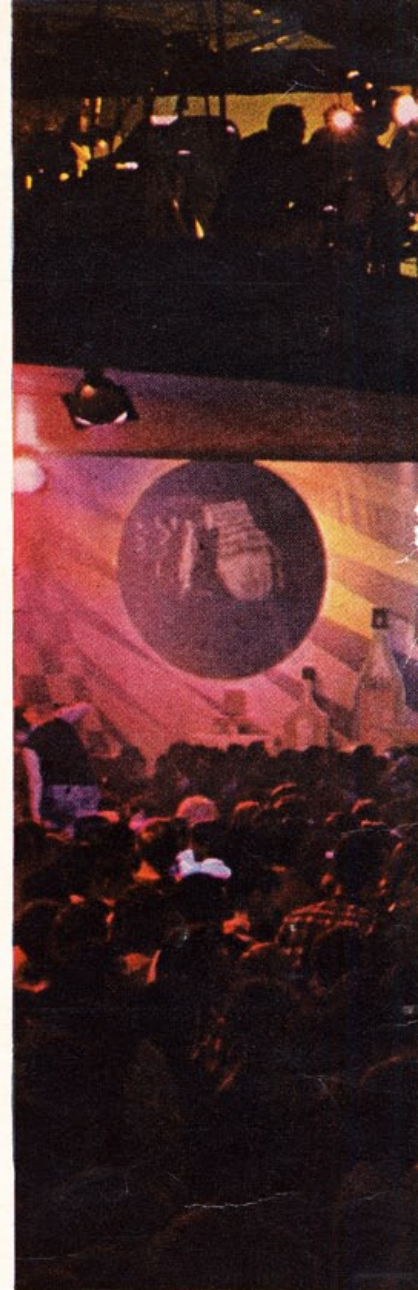
At Cheetah, once Broadway's Riviera Terrace, the massive hall holds 1,000 couples. Most are young and energetic, but there is a library, a movie room and color TV for those who run out of breath.